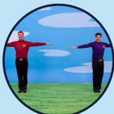
Keep your distance