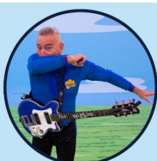
Cover your mouth and nose when you sneeze or cough