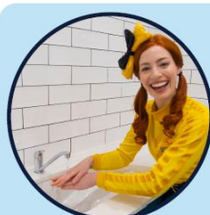
Clean your hands with soap and water