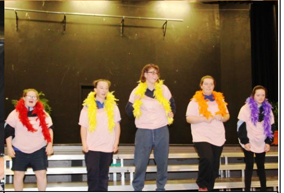
'She'll Be Coming Round the Mountain' – Christian folk song