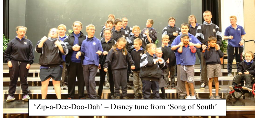
'Zip-a-Dee-Doo-Dah' – Disney tune from 'Song of South'