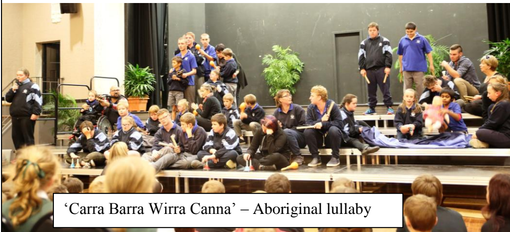
'Carra Barra Wirra Canna' – Aboriginal lullaby