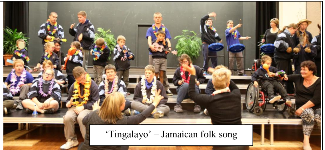
'Tingalayo' – Jamaican folk song