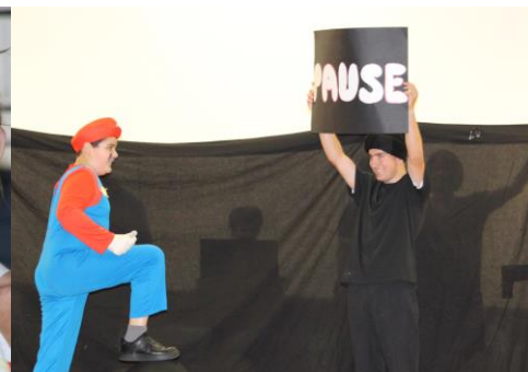
Room 3 – 'Mario Live'