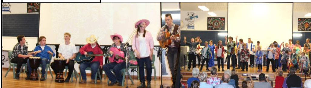
Room 5 – 'Country Mash'