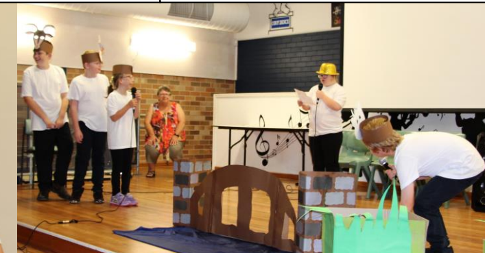
Room 1 – 'The Three Billy Goats Gruff'