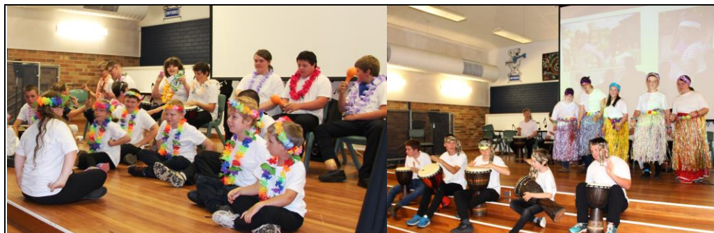
Rooms 1, 2 & 4 – 'Tabanaba'